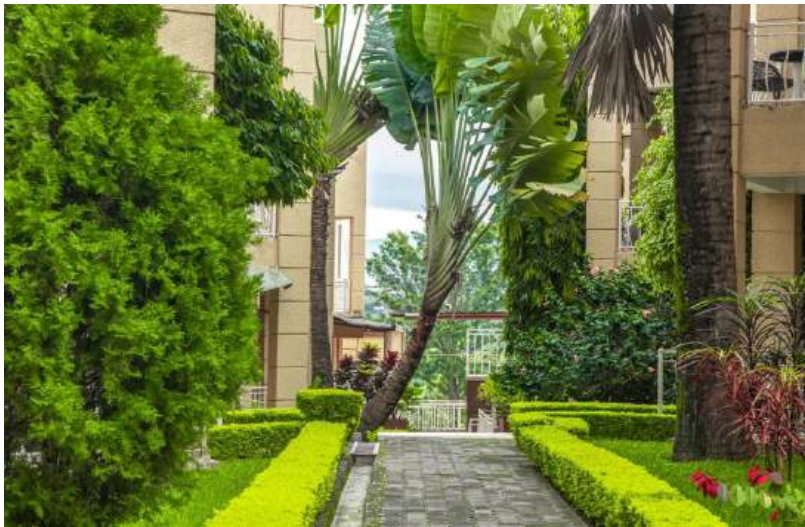
Park View Courts Hotel

2km from Kigali Convention Center, 5km from the Airport