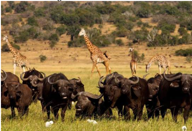
Home to the Big 5