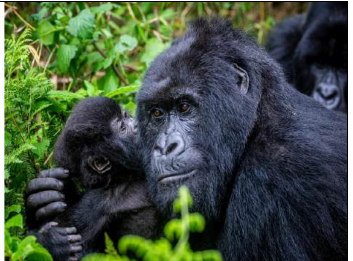
Meet the Mountain Gorillas