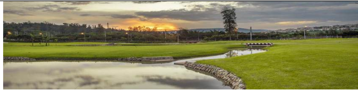
Enjoy Playing Gold at Kigali Golf Club

Visit the main city museums: The Museum of Natural History is the best museum in Kigali and was built with the purpose of documenting the beauty of Rwanda.