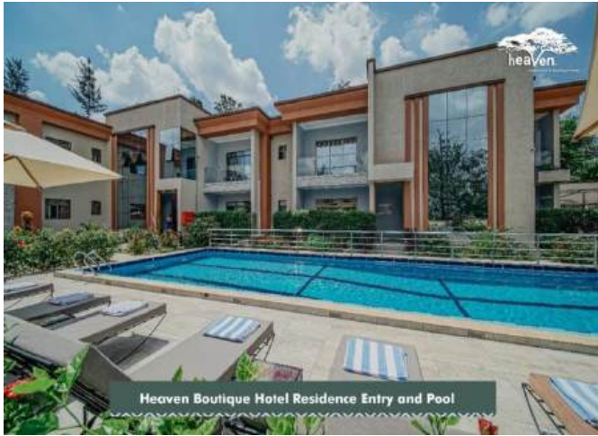
Heaven Boutique Hotel Residence Entry and Pool