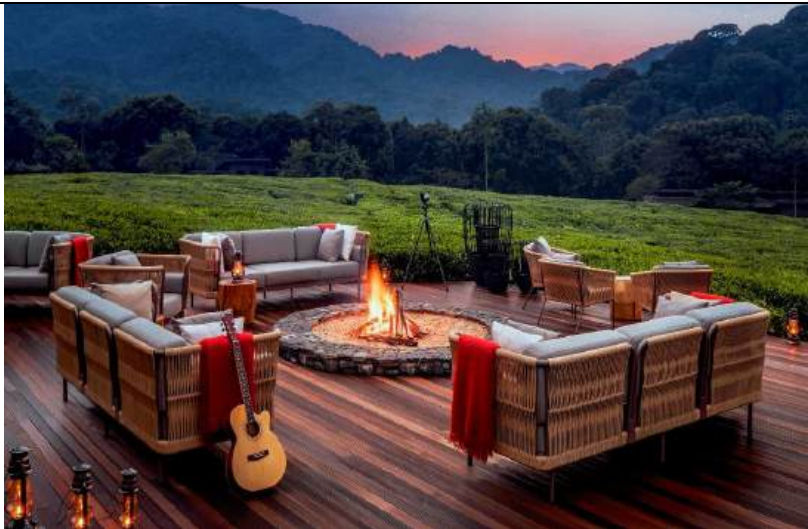
Enjoy relaxing and luxurious life in Nyungwe National Park