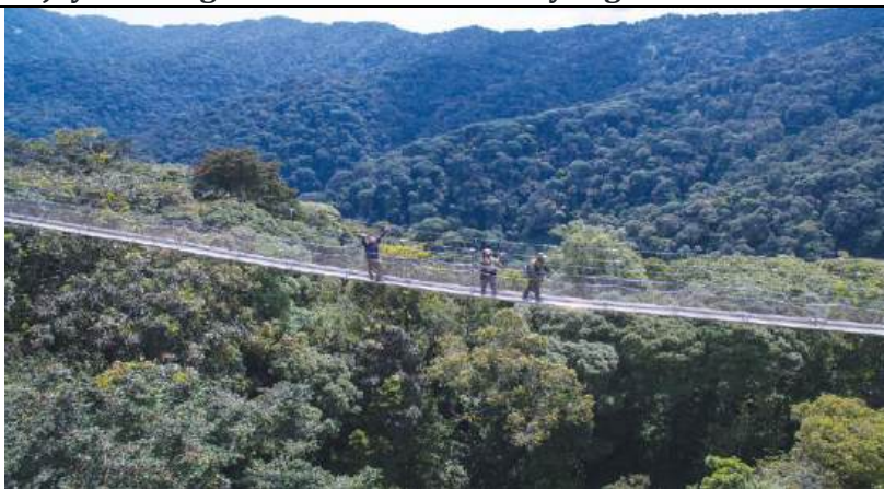
Primate & Hiking Paradise