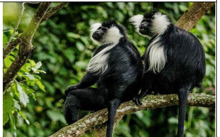
13 primate's species