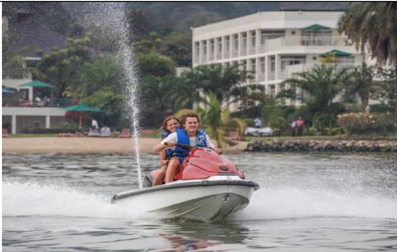
Perfect weather throughout the year