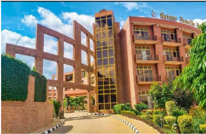
Ste Famille Hotel 5km distance to the conference venue,10km from the airport