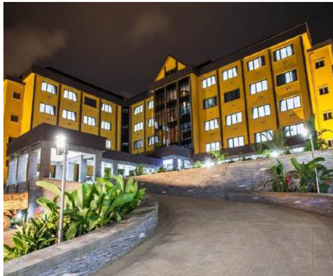
Grand Legacy Hotel

2.5km from Kigali Convention Center, Kigali International Airport is 2 km away.