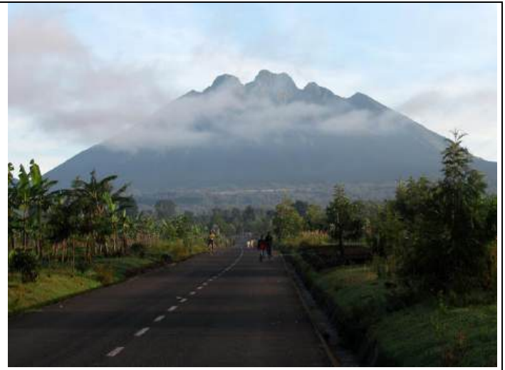
Hiking the Volcanoes