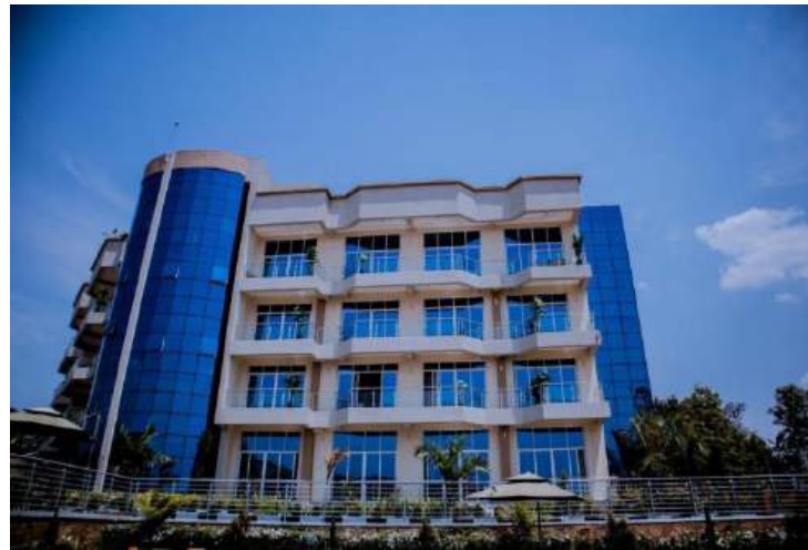
Madras Hotel and Apartments 7.4km distance to the conference venue,12km from the Airport

Email: reservation@saintefamillehotel.com