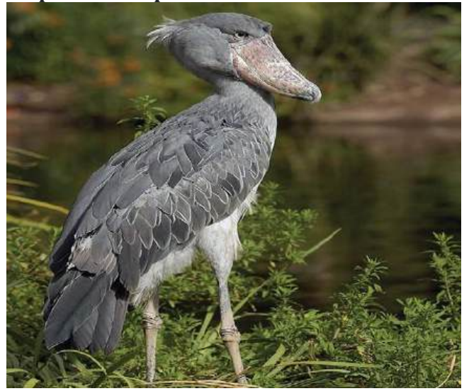
More than 500 bird's species